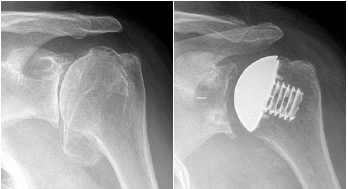
Anatomic Total Shoulder Arthroplasty X-ray, Pre-operative and Post-operative X-ray

Total shoulder arthroplasty is a joint replacement surgery for a variety of painful shoulder joint conditions. The ball and socket portion of your shoulder will be replaced with metal and plastic parts that are similar in shape and size to your own shoulder anatomy. The socket portion of your shoulder is replaced with a plastic cup and the ball portion is replaced with a metal ball attached to a long metal stem that is placed within the humerus.